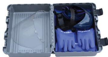
1 | Cryogenic Safety Equipment