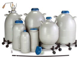
2 | Additional dewars